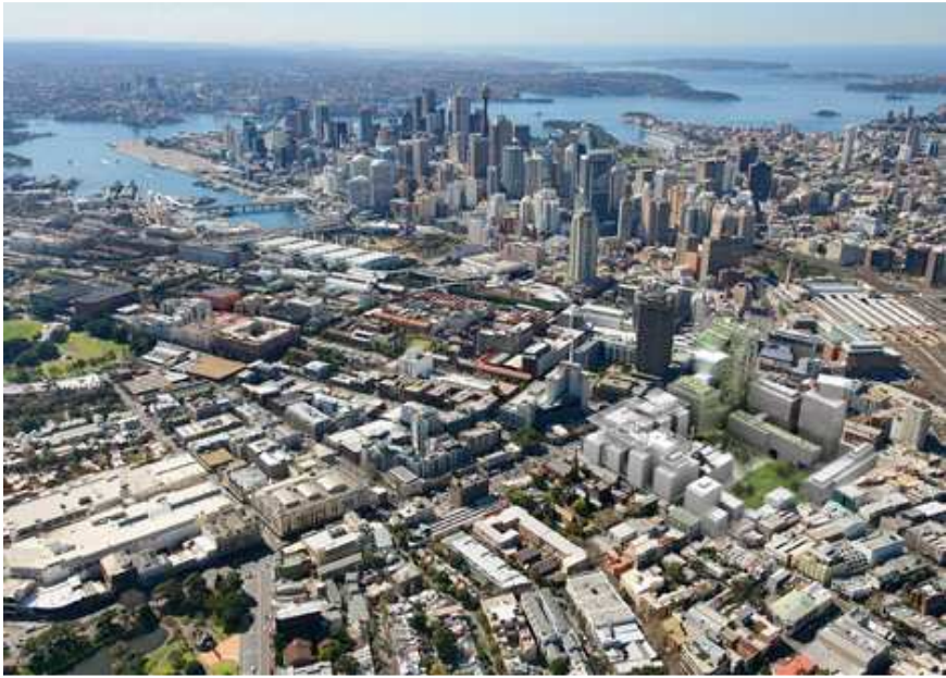
Central Park Sydney

Other living walls we've featured recently include London's largest green wall in Victoria that the designers said will combat flooding and a family house that conceals a wall of plants behind its slate-clad facade.