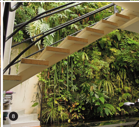
2-4. The Rainforest Rhapsody, a 2000-square-foot vertical green wall at Six Battery Road uses 120 species of plants native to Singapore and the surrounding region.