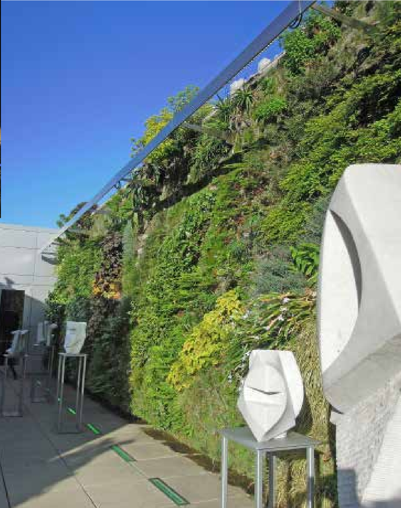
This beautiful vertical garden designed by Patrick Blanc is located in Charlotte NC.